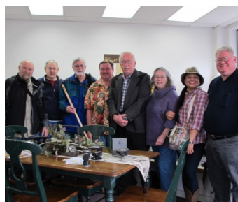
Ries Tours group

Larry Cederblom of the NW group of the Magic Lantern Society will present the History of Magic Lanterns in the Northwest. Their presentation will cover local manufactures and our famous photographers.